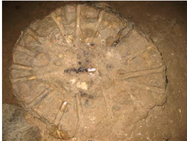
Figure 2: The remaining stump of the stalagmite

As the first step in the removal of the stalagmite the one inch (24mm) diameter would have been drilled, by hand, around the circumference of the stalagmite. Following the drilling, the stalagmite would have been sawn. The pressure would then have been applied by pulling on the stalagmite with block and tackle until the new perforated base fractured.