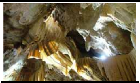
Jenolan's 'Orient Cave', lit with Weidmüller LEDs

We are currently in the process of issuing invoices to attendees and finalizing the thousands of details that go into the organizing such an