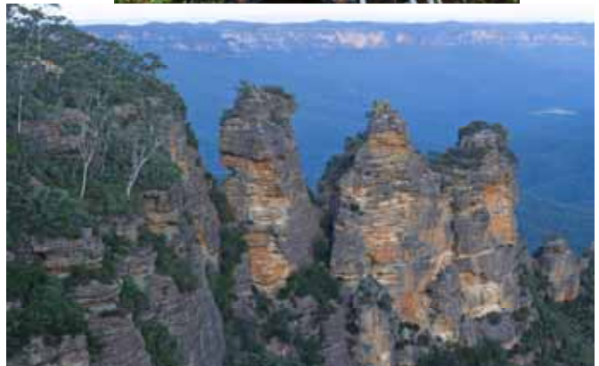
The Three Sisters—Katoomba, Blue Mountains