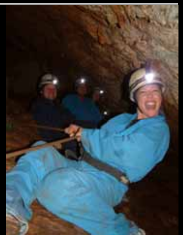
USING ACOUSTIGUIDE AUDIO DEVICES, NETTLE CAVE JENOLAN'S BLUE LAKE